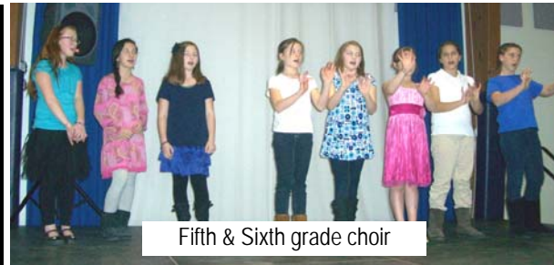
Fifth & Sixth grade choir