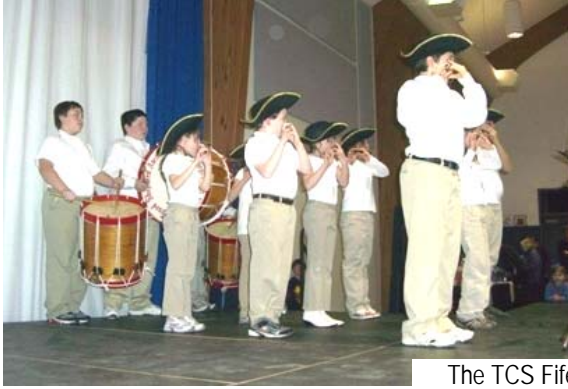
The TCS Fife & Drum band