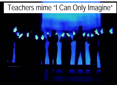
Teachers mime "I Can Only Imagine"