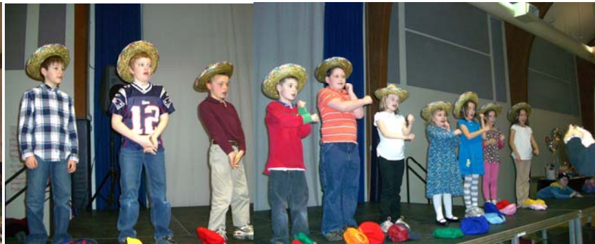
Second Grade class entertained us by singing the same song in 3 different languages: English, French & Spanish